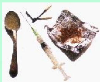
Could ibogaine stop the addiction to deadly drugs such as heroin?

Not all scientists are convinced of the healing properties of those suffering addiction. Among ibogaine's side-effects are ataxia (loss of muscle coordination), nausea, vomiting and raised blood pressure. The compound also causes tremors, hallucinations and apprehension. Moreover, there is still the death to consider in the cancelled FDA trials.